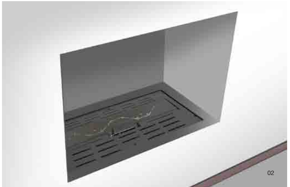
02_ Example of fitting