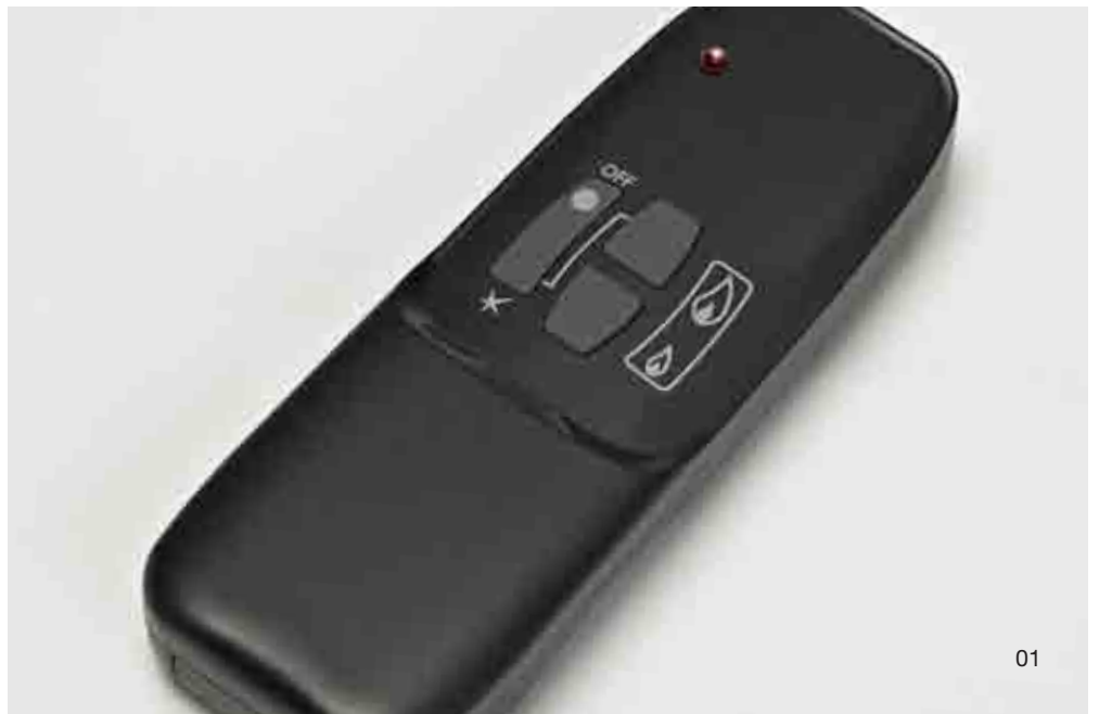
01_ On/Off infrared remote control and flame setting