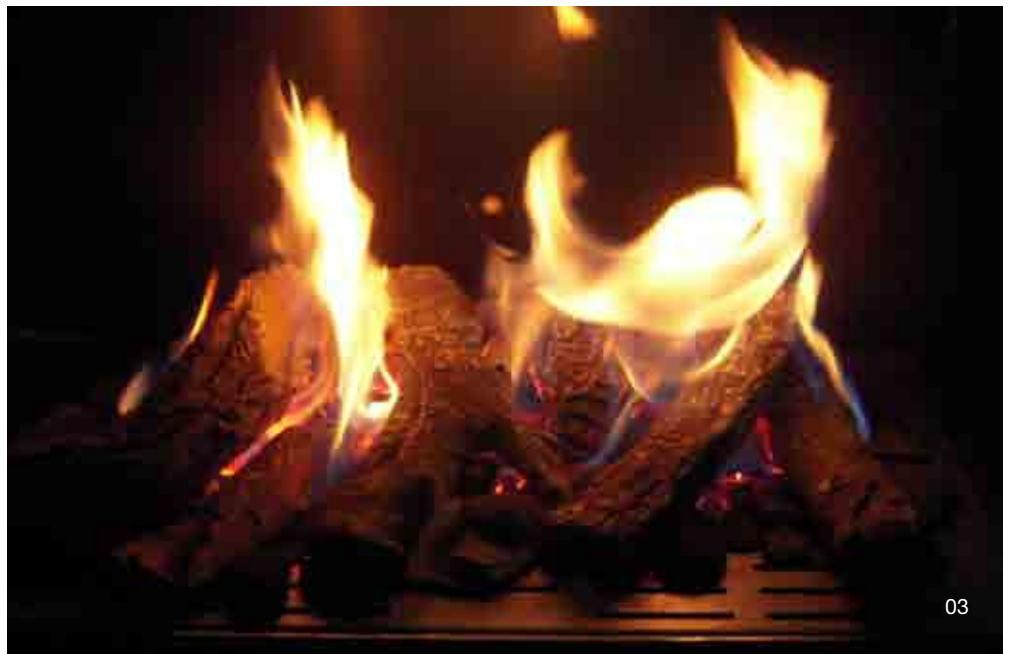
03_ Customizing with log set or river pebbles